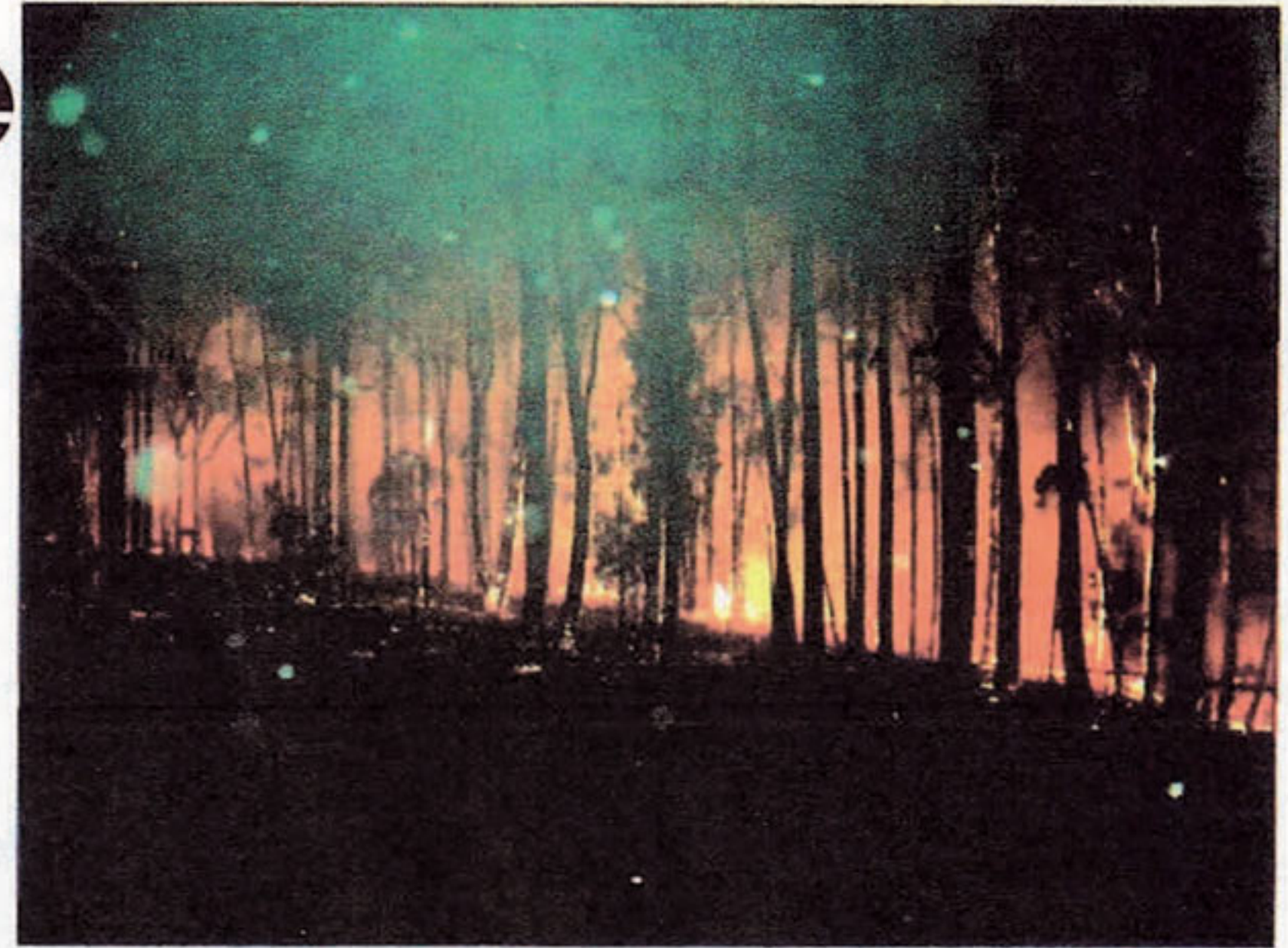
Black day: fire almost surrounded the Beruldsen's Darlimurla home earlier this year.